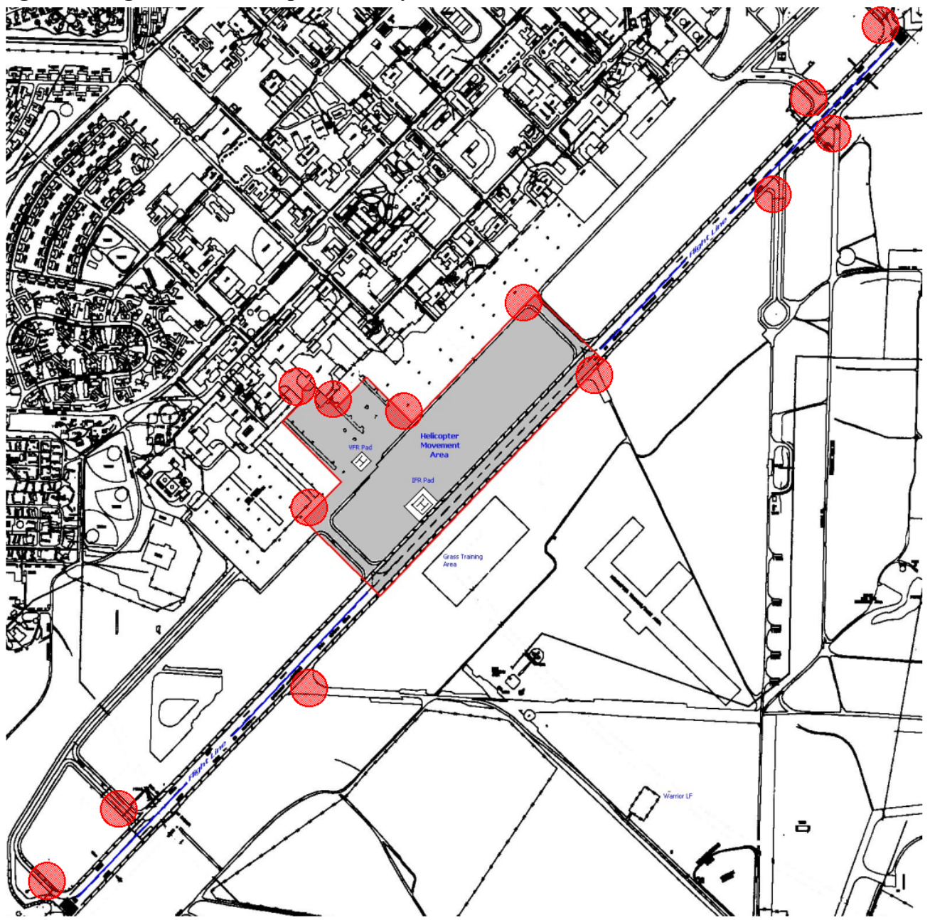
Figure 2. Flight line Area Map with Entry Points